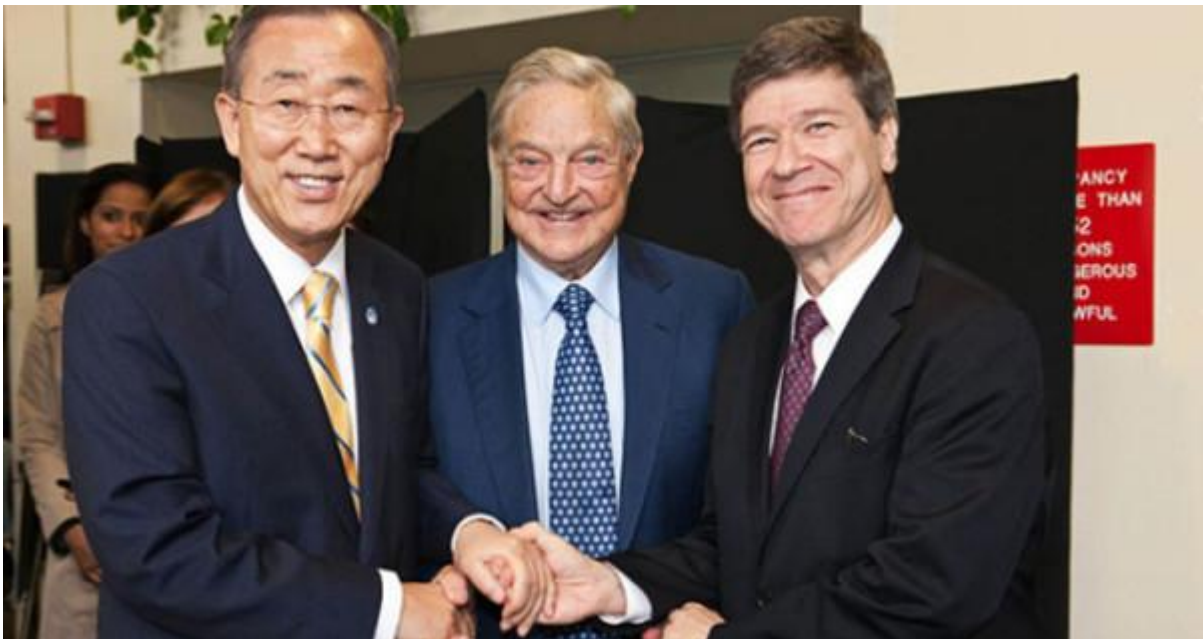
UN Secy Gen Ban Ki Moon, George Soros and Jeffrey Sachs

Although Open Society funds radical Catholic groups, Soros was unable to capture the papacy as his ultimate prize in world domination because the two previous conservative Popes steadfastly opposed his radical agenda. Until now.