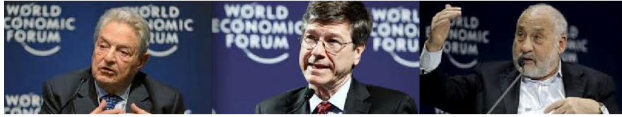
George Soros Jeffrey Sachs Joseph Stiglitz

Jeffrey Sachs, Economist, Director of Columbia University’s Earth Institute, Special Advisor to the U N Secretary General, and long time Soros collaborator and beneficiary.